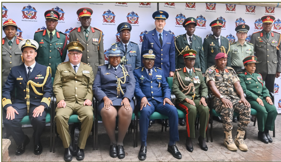
Defence Attaches and Advisors accredited to the Republic of Namibia during New Year Greetings

31. This programme serves as a vital link in advancing Namibia’s defence diplomacy and international cooperation through the deployment of fifteen (15) Defence Representatives, resident in Angola, Botswana, Federative Republic of Brazil, China, Cuba, Democratic Republic of Congo, Federal Democratic Republic of Ethiopia, India, Federal Republic of Germany, The Russia Federation, South Africa, United Republic of Tanzania, United States of America (New York), Zambia and Zimbabwe but also accredited to many countries around the globe, where we maintain defence partnerships and strategic interests. Its key objectives are to strengthen bilateral and multilateral defence relations, promote strategic partnerships, and facilitate the exchange of military knowledge, training, and technology.