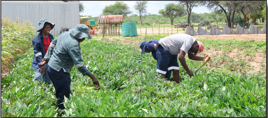
Weeding and pests control