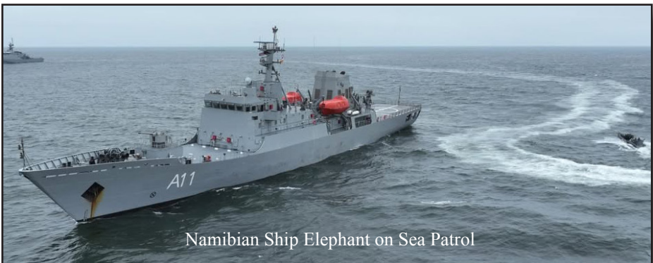
Namibian Ship Elephant on Sea Patrol

30. This programme ensures protection of our maritime territory, safeguarding national resources, and ensuring the security of our coastal communities. The programme's objectives are to strengthen naval operational readiness, monitor and secure Namibia's exclusive economic zone, and prevent transnational organised crimes such as piracy, trafficking, illegal, unregulated and unreported fishing, and pollution. It also seeks to develop a highly trained and technologically proficient naval force, enhance search and rescue capabilities at sea, and support disaster response and humanitarian operations along the coast.