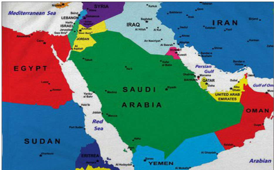
Middle East Political Map

10. These developments present a deeply concerning global security landscape. It is evident that the environment is becoming increasingly volatile, complex, and unpredictable. Conflicts, though geographically distant in some cases, are not isolated in their impact. They disrupt global supply chains, heighten economic pressures, exacerbate humanitarian crises, and increase security risks across regions—including here at home and throughout Africa.