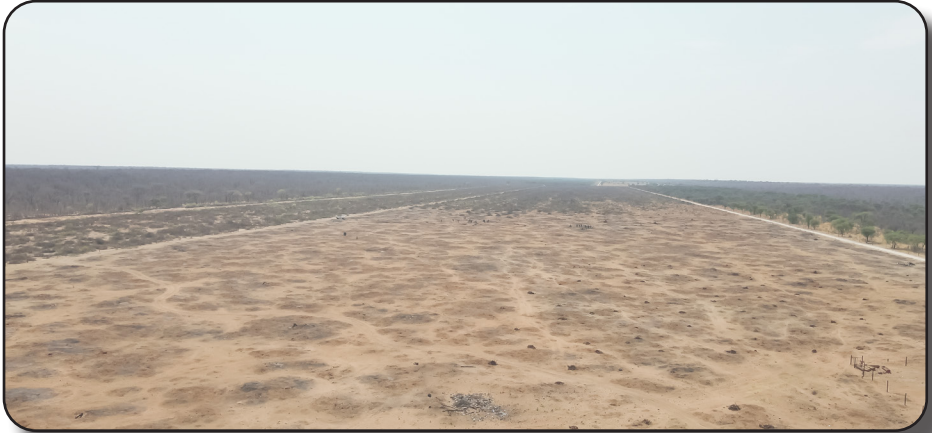
Cleared land for cultivation