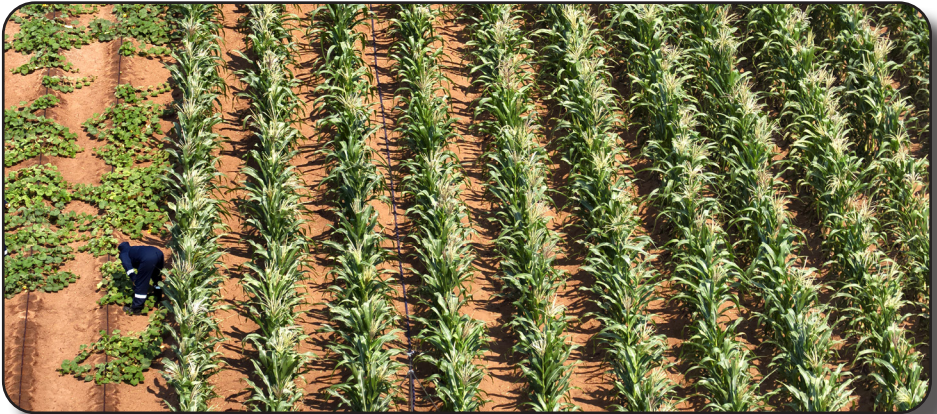
Sweet potatoes and Maize on trial