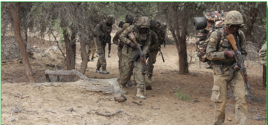
Troops in the Field Training Exercise

25. This programme is designed to keep our forces prepared. Its main goals are to equip our sailors, airmen, soldiers, and civilian personnel with advanced technical, managerial, leadership, and operational skills; to improve discipline and adaptability in responding to both security and humanitarian challenges; and to develop a highly skilled workforce capable of contributing not only to national defence but also to broader socio-economic development. Through continuous training, this programme ensures that our defence force remains modern, capable, high-performing, and responsive to the changing needs of our nation. This programme is allocated Seven Hundred and Two Million, One Hundred and Sixty-Nine Thousand Namibian Dollars (N$702,169,000.00) .