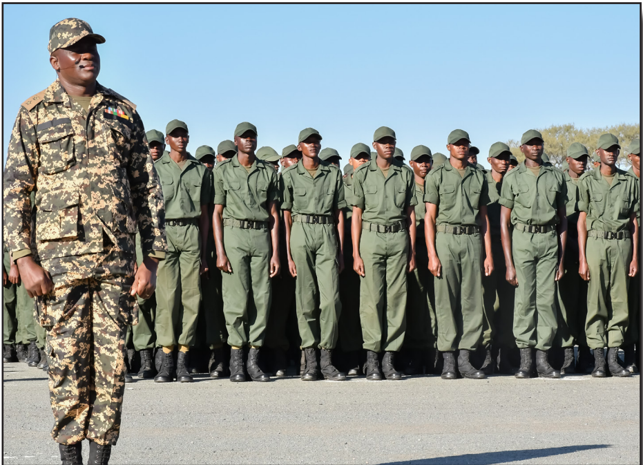
Recruits on Parade at the opening of Basic Military Training at Namibia Defence Force Training Establishment

21. The future of the NDF depends on the quality, readiness, and professionalism of its soldiers. As the force continues to age, the Ministry has implemented plans to recruit 1,500 young people annually into the NDF until 2029/2030. This targeted recruitment is vital to ensure a gradual renewal and the force's sustainability, while maintaining optimal operational capability. Bringing in younger personnel helps the NDF build a talent pipeline that can be systematically developed, mentored, and deployed to meet changing security demands. The recruitment effort has attracted great interest, with applications received from all 14 regions of our country. However, Honourable Members, I must draw your attention to a troubling issue that has long challenged the NDF during recruitment exercises.