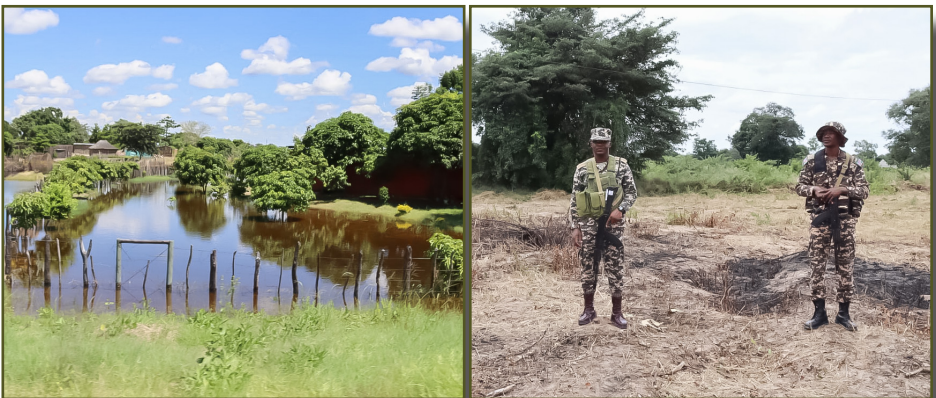
NDF troops assessing the effects of flood at Kabbe North and South Constituencies in Zambezi Region

5. Defence, therefore, is not a barrier to productivity; it is its foundation. By ensuring a stable and predictable environment, Defence creates the conditions in which investment can flourish, economic activity