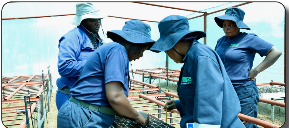
Seedlings production in the Nursery