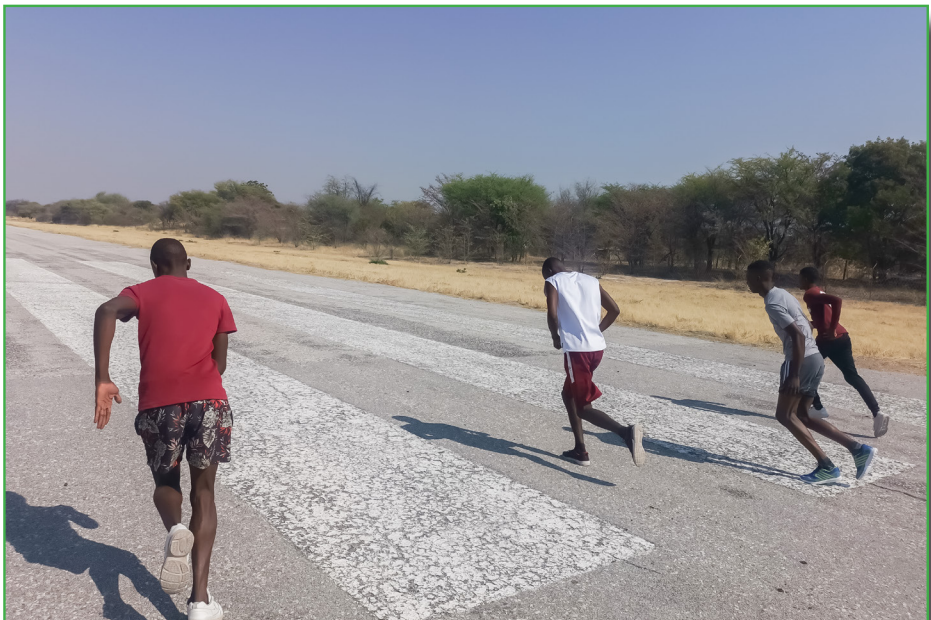
Young Namibians taken through pre-recruitment fitness test

15. As part of the Force Rejuvenation drive, One Thousand Seven Hundred and Five (1,705) young recruits are currently undergoing basic military training at the NDF Training Establishment in Osona, with graduation scheduled for May 2026. In addition, the Ministry is at an advanced stage of recruiting another One Thousand Five Hundred (1,500) youth, whose training will commence in the 2026/27 Financial Year. Beyond recruitment, the NDF has successfully trained Two Thousand Four Hundred and Nineteen (2,419) members in diverse combat and academic competencies, equipping them with the skills required to operate effectively in the era of digitalisation.