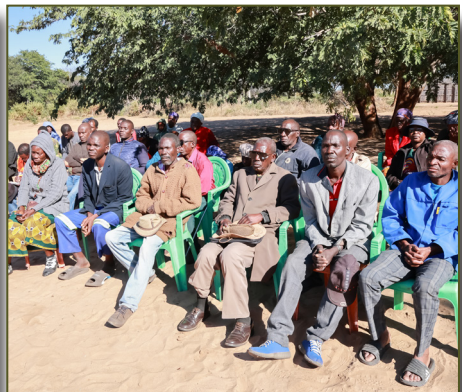
NDF, BDF and Stakeholders conducting Civil Military Cooperation Sensitisation Campaign during Phases One and Two